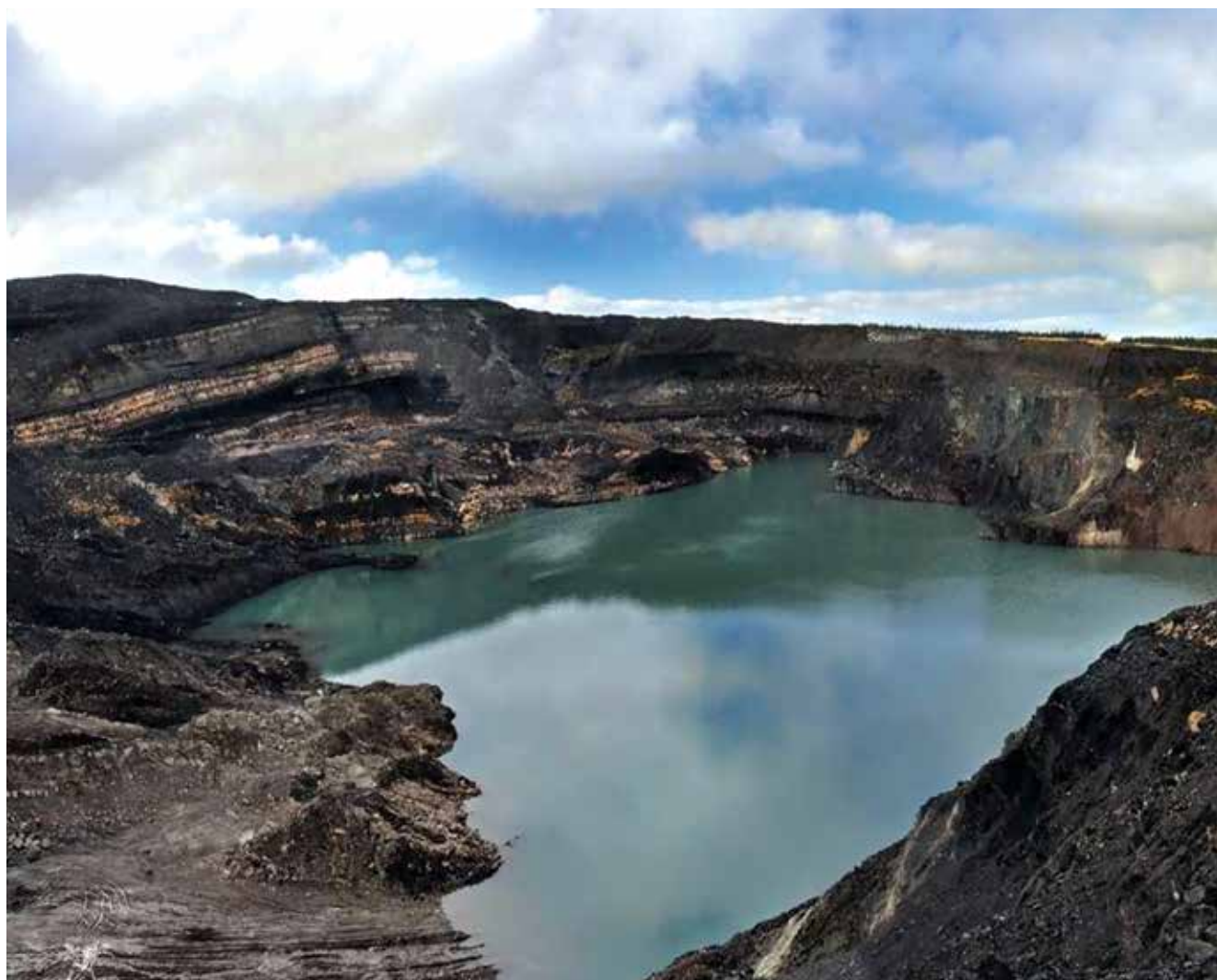
Figure 2. Large flooded hole with steep wall at Dunstonhill opencast coal mine in April 2013 after being abandoned.

So how about the existing oil and gas projects in Vietnam that have been operated for more than 10 or 20 years? Since the decommissioning and abandonment provision approach has been applied to them, the government in collaboration with PVN needs to check the balance of the financial guarantee fund for each project and monitors the site to assess the outstanding decommissioning liability. If the fund is inadequate for undertaking the outstanding work, the operator must add to the fund immediately or as soon as possible. This is especially important for projects executed via joint ventures or production sharing contracts between PVN and international firms since the latter may go into liquidation at any time. It is not only reasonable but also fair because the projects have lasted more than 10 or 20 years, bringing certain profits to the operators from oil sales.